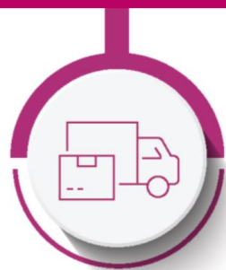
Transport and logistics