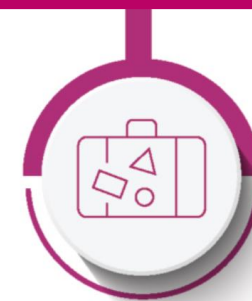
Tourism and hospitality