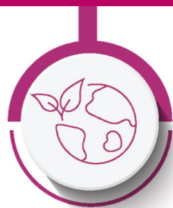
Climate and energy