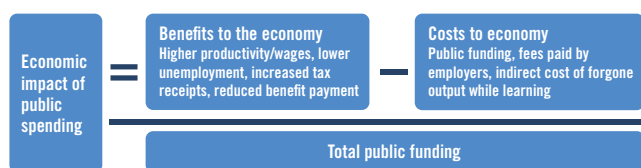
Figure 2: Social costs and benefits